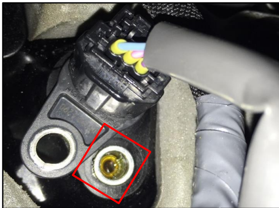
Figure 3. Engine Oil in Cam Sensor Bolt Hole