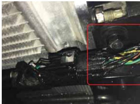
View from front