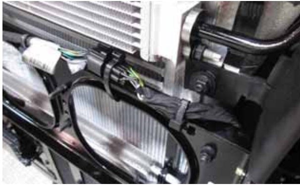
View from front