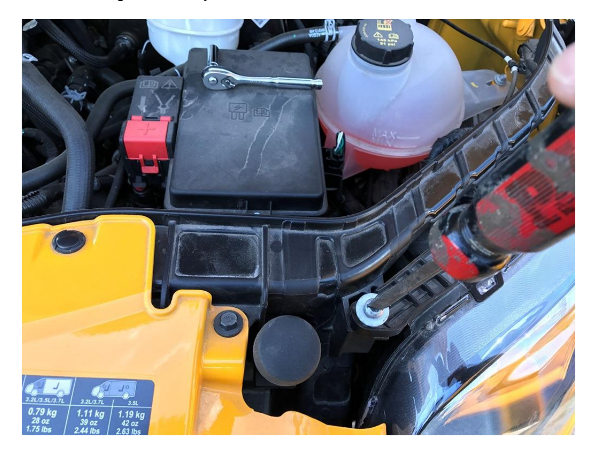
Inspecting/Securing AC Line.

8. Re-install headlight assembly and secure with the two screws.