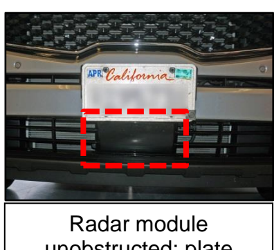
unobstructed; plate mounted correctly.