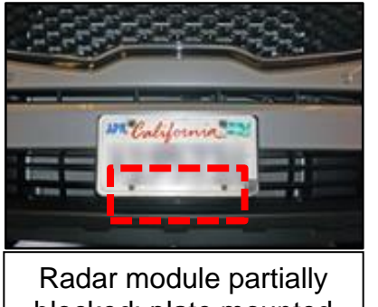
blocked; plate mounted incorrectly.

Follow the instructions below to ensure that the AEB/FCA system is not being impaired by an incorrect license plate installation.