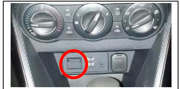
Figure 1. SD Card Slot