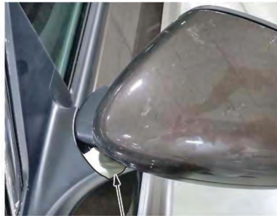
Tape over cutline seal.