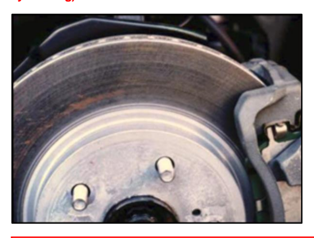
Figure 1. Slight Rust on Rotor (Easy to Remove by Braking)