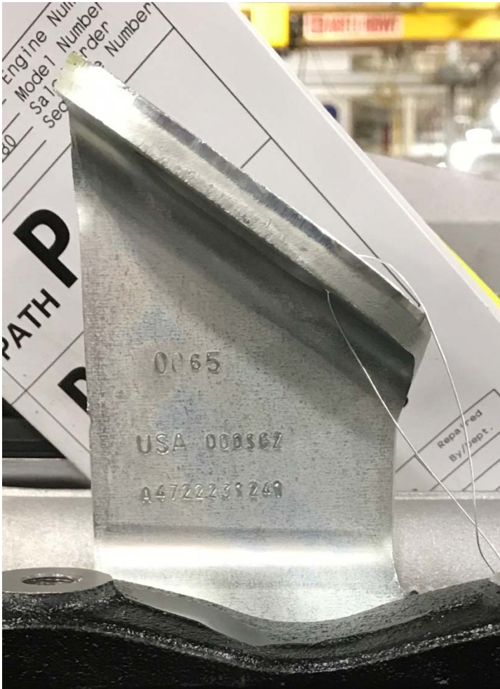
Figure 2 – Front Lifter Bracket Part Number Identification