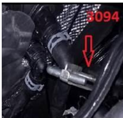
Figure 1. Heater core coolant flow blocked using a 3094 hose clamp.