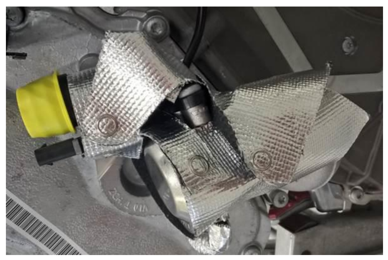
Figure 2. Insulation on Bank 2 pressure sensor after installation.