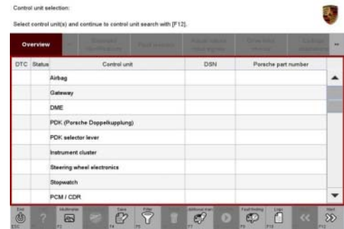
Control unit selection