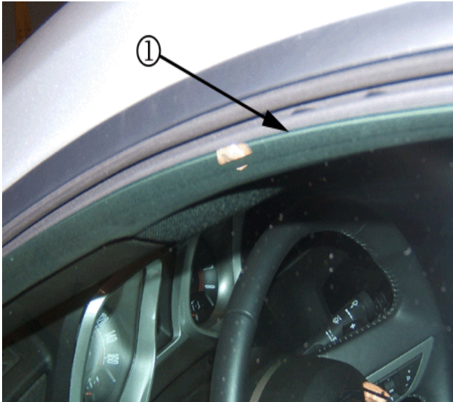
Window in "Indexed" Position (1) (When Door Latch is Opened)