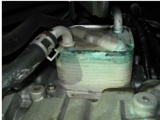
(View looking up from the bottom of the vehicle)

Dealers have reported coolant leaking from the transmission cooler line hoses at the CVT7 fluid cooler (see photo below). Normal dealer repairs have been to replace the hoses and/or clamps at the affected area.