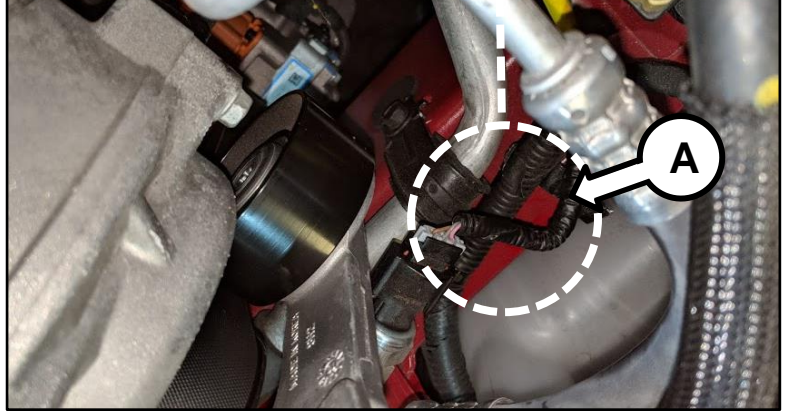
Page 1 of 1