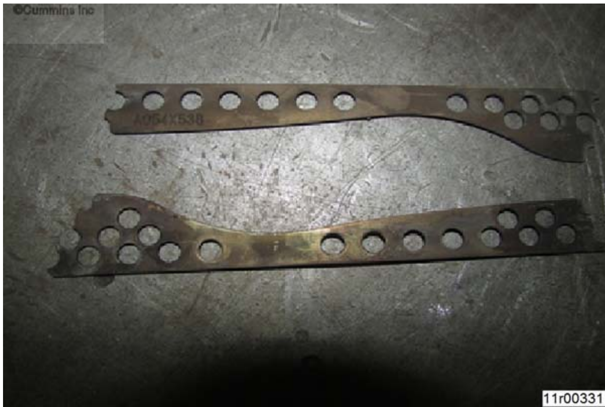
Figure 2, Broken Aftertreatment DOC Baffle.