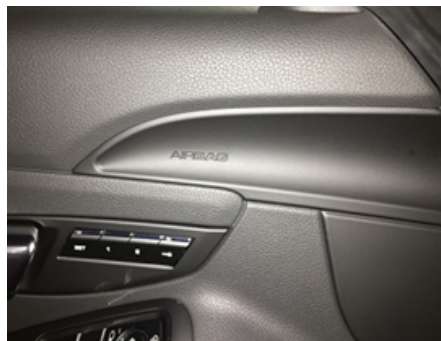
911 (991-II) Cabriolet / 718 Boxster (982)

Important Notice: Technical Bulletins issued by Porsche Cars North America, Inc. are intended only for use by professional automotive technicians who have attended Porsche service training courses. They are written to inform those technicians of conditions that may occur on some Porsche vehicles, or to provide information that could assist in the proper servicing of a vehicle. Porsche special tools may be necessary in order to perform certain operations identified in these bulletins. Use of tools and procedures other than those Porsche recommends in these bulletins may be detrimental to the safe operation of your vehicle, and may endanger the people working on it. Properly trained Porsche technicians have the equipment, tools, safety instructions, and know-how to do the job properly and safely. Part numbers listed in these bulletins are for reference only. The work procedures updated electronically in the Porsche PIWIS diagnostic and testing device take precedence and, in the event of a discrepancy, the work procedures in the PIWIS Tester are the ones that must be followed.