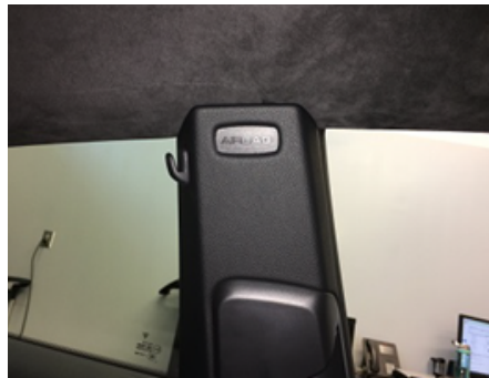
911 (991-II) Coupe