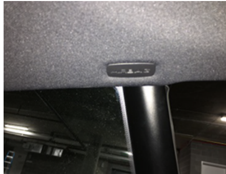
718 Cayman (982)