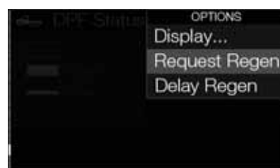
Inactive. Vehicle in motion or regen not needed

Request Regen is now included in the OPTIONS menu off of each of these screens as seen below. The function can only be selected if a parked regeneration is required, and is locked out if the unit is not stationary.