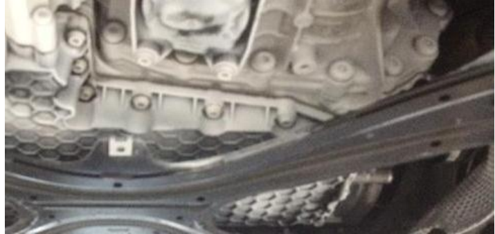
Figure 2: Transmission with oil leak detection spray applied.