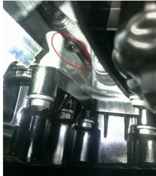
Figure 4. Double seal weep hole location.