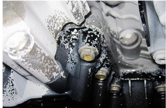
Figure 3. Oil leak.

Tip: If there are drips after the test drive as shown (Figure 3) you should be able to determine if the leak is from the ATF sump gasket or if the leak is from elsewhere. Make sure to check for leaks above the sump gasket. Check the seam of the transmission case split and the weep hole of the double seal (Figure 4). Both of these leaks can be confused for an ATF sump gasket leak.