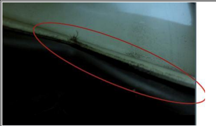
Figure 1: Gap between Boot seal and Hood