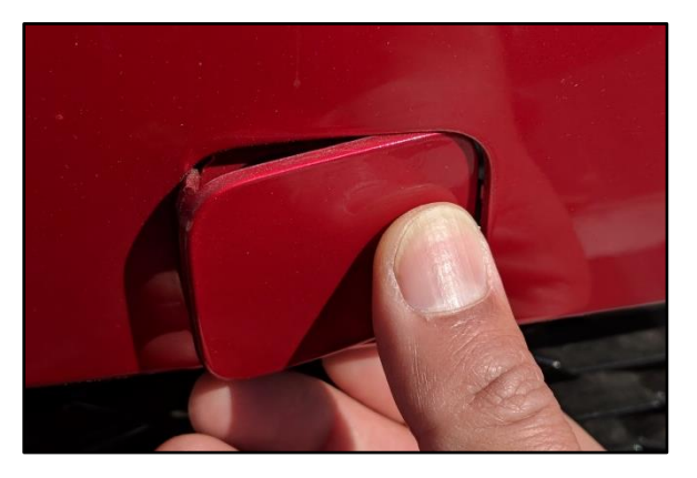
1. Push the right side of the tow hook cap as shown to unlock and release the left side locking tab. <u>Note: Press</u> on arrow pointing right.