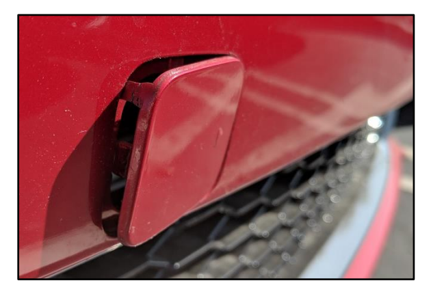
2. The left side of the tow hook cap should now be exposed as shown. To remove cap, lift on the left side.