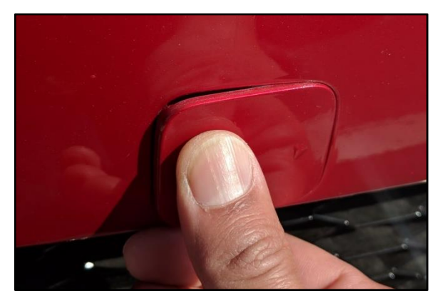
5. Once the right side of the cap is inserted, press down firmly on the left side of the tow hook cap to lock the cap into the bumper cover hole.