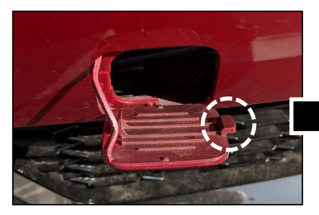
3. Once the tow hook cap is detached, inspect the protruding tab before re-installing. Replace cap if damaged.