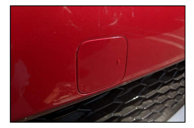
6. The <u>correctly inserted tow hook</u> <u>cover</u> should rest flush with the bumper cover surface as shown.