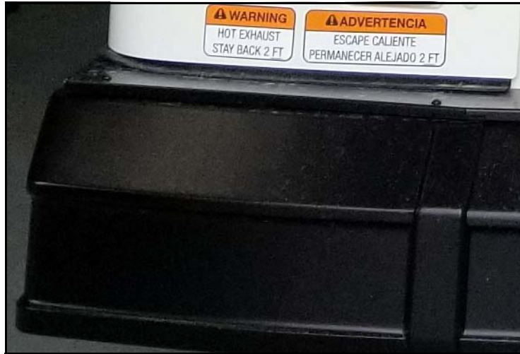
Figure 1. Hot exhaust warning decal.

As detailed in the MCI Maintenance Manuals in addition to the decal on the roadside rear bumper, do not park the coach with the rear bumper within two feet of a barrier or obstruction.