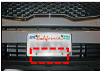
Radar module partially blocked; plate mounted incorrectly .

On 2WD vehicles equipped with AEB, the radar sensor is mounted below the front bumper cover. The license plate needs to be positioned to provide an unobstructed “forward view” for the AEB radar module. If the bracket and license plate are mounted incorrectly, the plate may interfere with the AEB sensor and cause the system to not operate correctly. The system may display the “Auto Emergency Braking Disabled Temporarily” message in the instrument cluster center and/or may illuminate the AEB warning light until the condition is corrected.