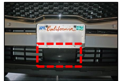
Radar module unobstructed; plate mounted correctly .