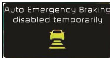
Warning message may alert driver that AEB is unavailable!