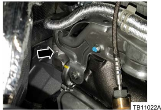
Figure 1 - Article 17-0009

NOTE: The information contained in Technical Service Bulletins is intended for use by trained, professional technicians with the knowledge, tools, and equipment to do the job properly and safely. It informs these technicians of conditions that may occur on some vehicles, or provides information that could assist in proper vehicle service. The procedures should not be performed by "do-it-yourselfers". Do not assume that a condition described affects your car or truck. Contact a Ford, Lincoln, or Mercury dealership to determine whether the bulletin applies to your vehicle. Warranty Policy and Extended Service Plan documentation determine Warranty and/or Extended Service Plan coverage unless stated otherwise in the TSB article. The information in this Technical Service Bulletin (TSB) was current at the time of printing. Ford Motor Company reserves the right to supersede this information with updates. The most recent information is available through Ford Motor Company's on-line technical resources.