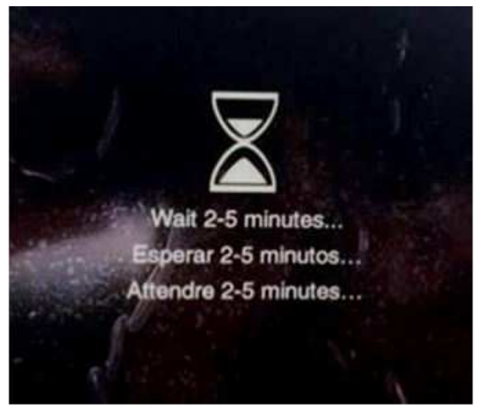
Fig. 2 Hourglass Screen

NOTE: During the update process you may see multiple hourglass screens for extended periods of time (several minutes) (Fig. 2). DO NOT remove the USB flash drive at this time. Only remove the USB flash drive when the update has completed, when the screen displays the software levels again.