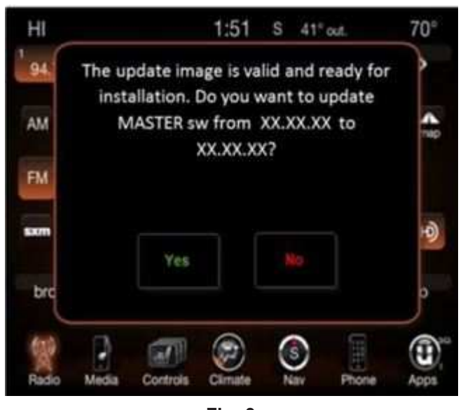
Fig. 3 Updated Software Screen