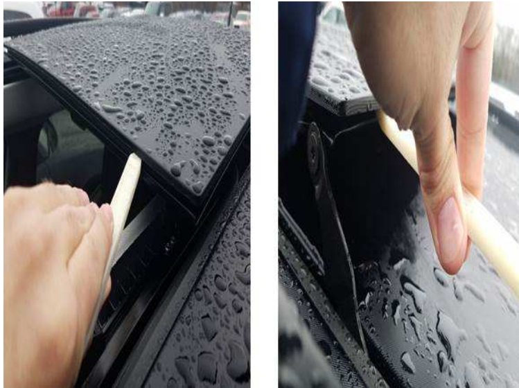
Fig. 6 Trim Stick Around Perimeter