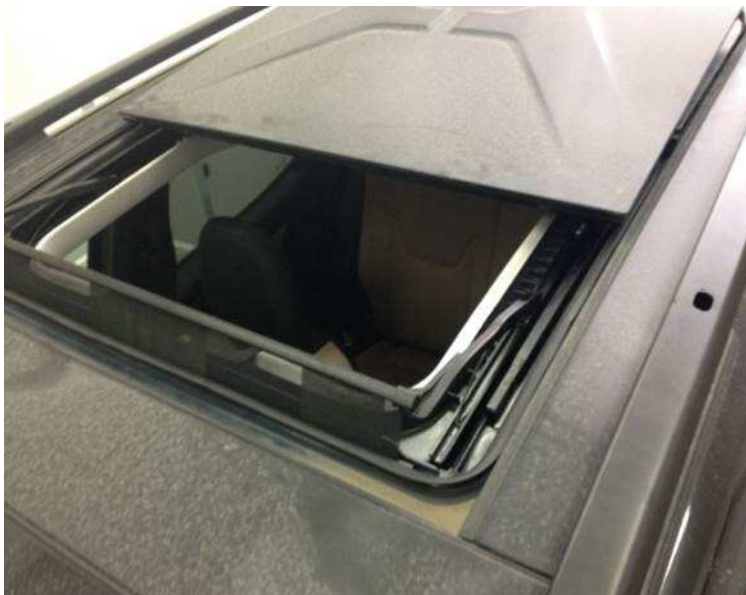
Fig. 4 My Sky Open