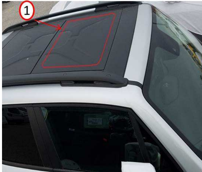
Fig. 1 Panel That May Be Stuck

Some customers may describe that the My Sky opens and vents without issue. When the My Sky front panel is unlatched it does not release - panel is stuck in place (Fig. 1) .