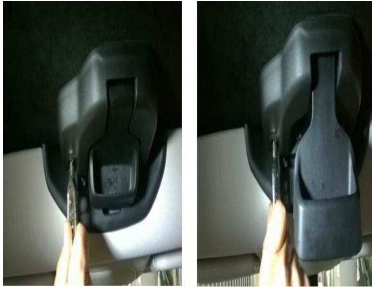
Fig. 2 My Sky Key