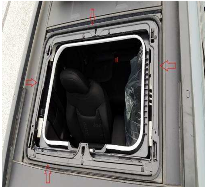
Fig. 10 Seal Area To Clean