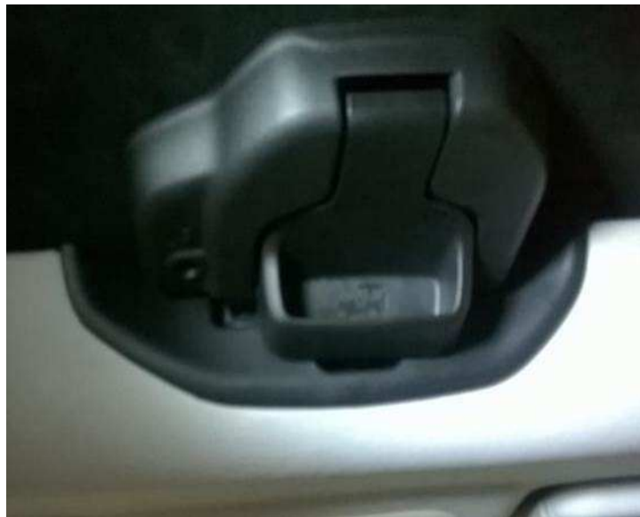
Fig. 3 My Sky Latch