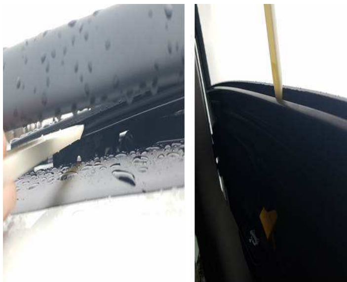
Fig. 5 Trim Stick At Seal