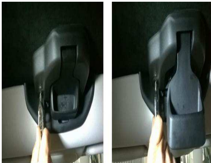
Fig. 7 My Sky Key