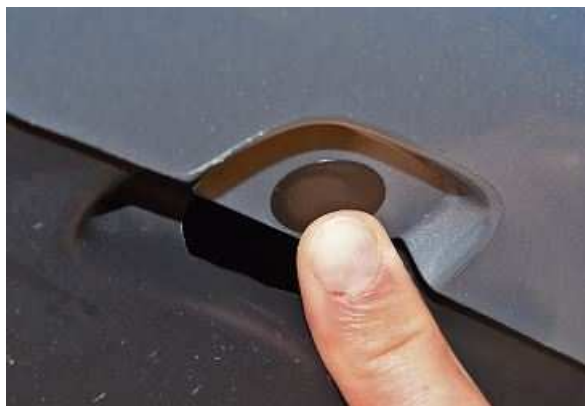
Fig. 3 Black Tape Circle Applied