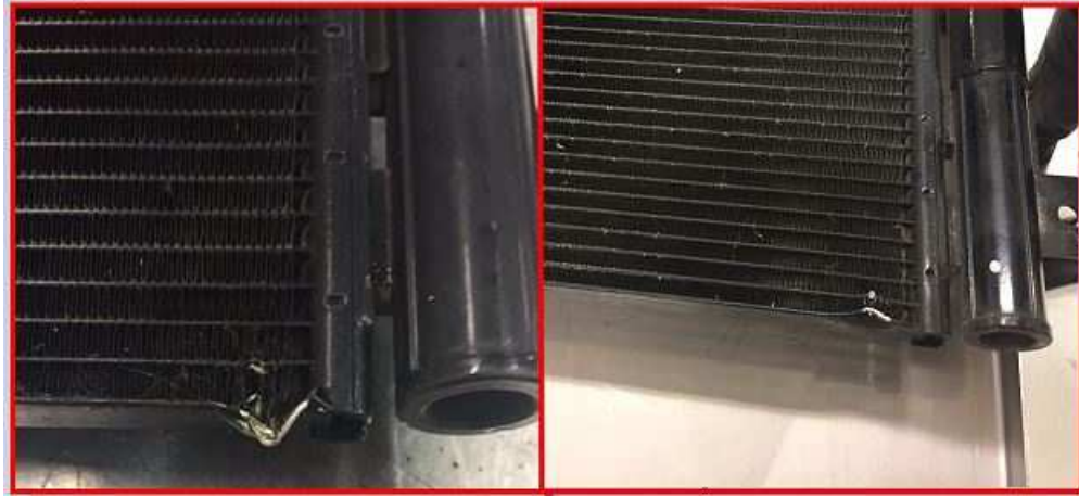
Fig. 1 A/C Condenser Damage