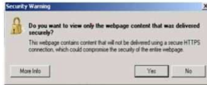
Fig. 1 Pop-up Security Message

NOTE: A blank USB flash drive must be used to download the software. Only one software update can be used on one USB flash drive.