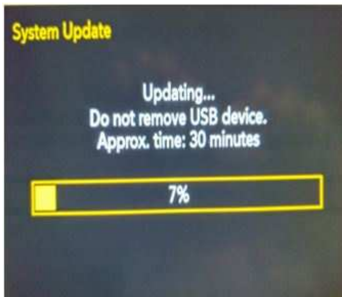
Fig. 2 Percentage Completed Screen

NOTE: There will be a variety of screens displayed throughout the update process. A black screen will appear multiple times in the process for a few minutes (Fig. 2) .