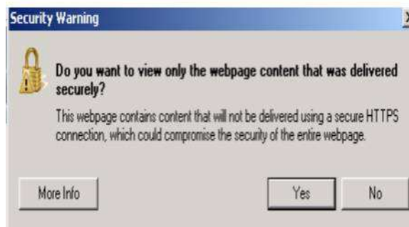
Fig. 2 Pop-up Security Message

If this Pop-up appears, select “NO” to continue.