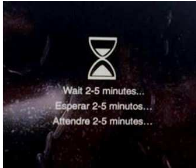
Fig. 3 **Hourglass Screen**

NOTE: **During the update process you will see multiple hourglass and “Please Insert Update USB” screens for extended periods of time (several minutes) (Fig. 3) or (Fig. 4) . DO NOT remove the USB flash drive at this time. Only remove the USB flash drive when the update has completed, when the screen displays the software levels again. The screen will say “Software updated successfully”.**