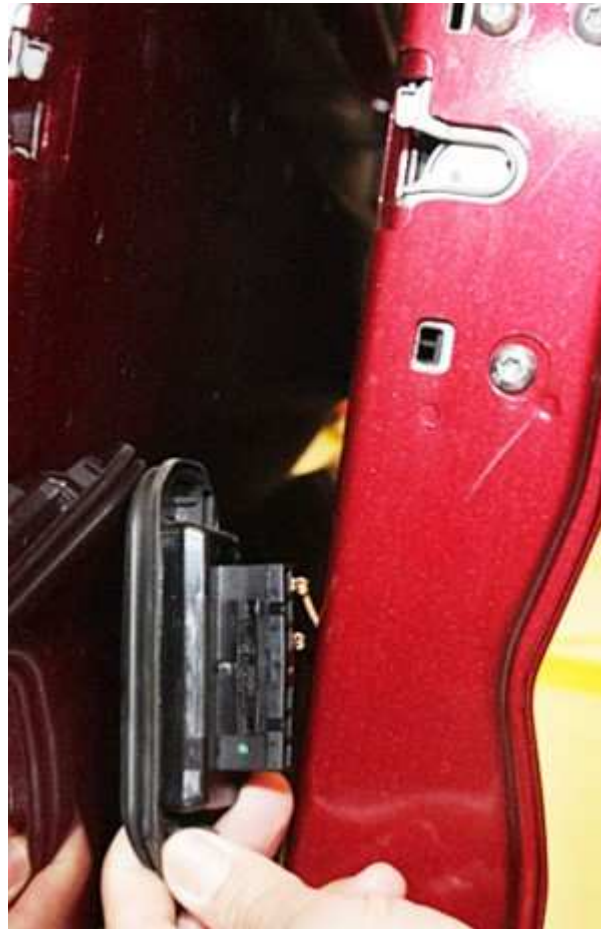
Fig. 2 Contact Switch Board