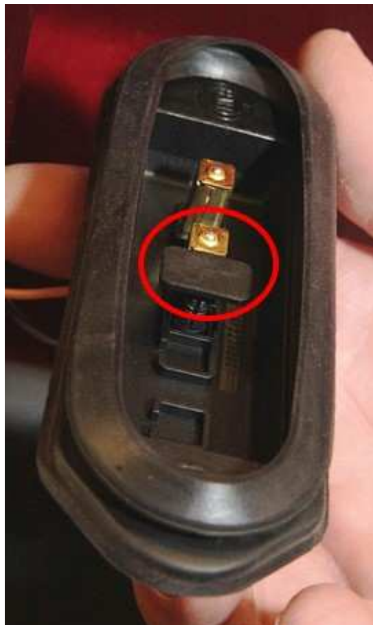
Fig. 5 Contact Board Button Installed