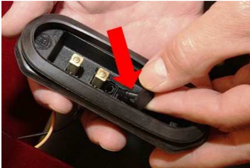
Fig. 4 Contact Board Button