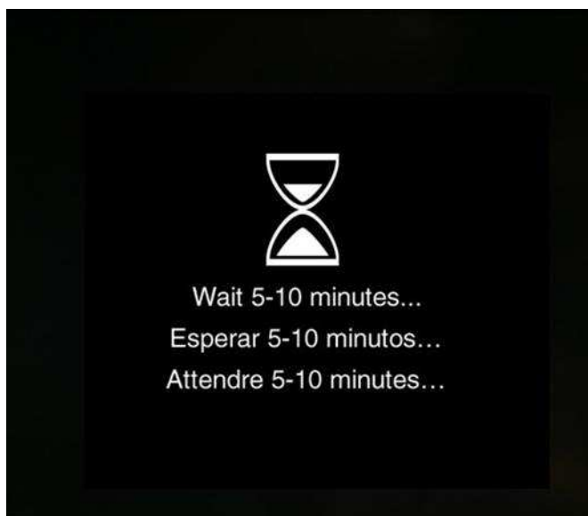
Fig. 3 Wait Screen