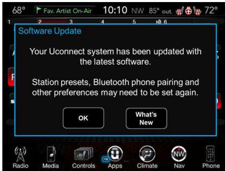
Fig. 5 Confirmation Screen

NOTE: If there are other hardware issues or concerns, contact the STAR Center for support.