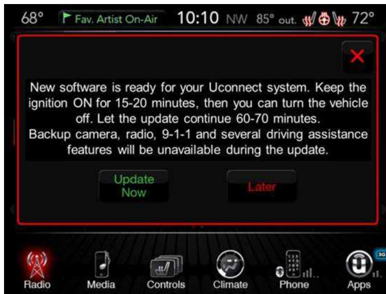
Fig. 1 Software Acceptance Screen

NOTE: This is an information only Service Bulletin to help the customer understand how they can perform their FOTA update. This document does not contain a LOP for reimbursement.