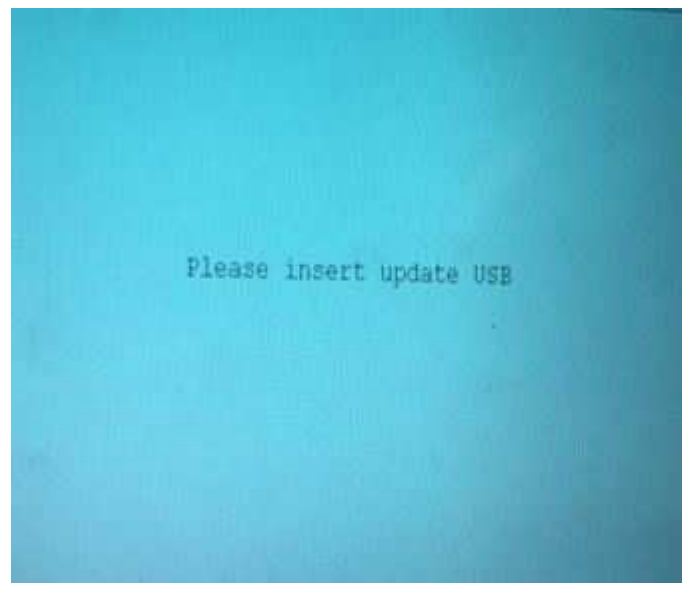
Fig. 4 **Please Insert Update USB**

5. Insert the correct USB flash drive with new software into USB port.