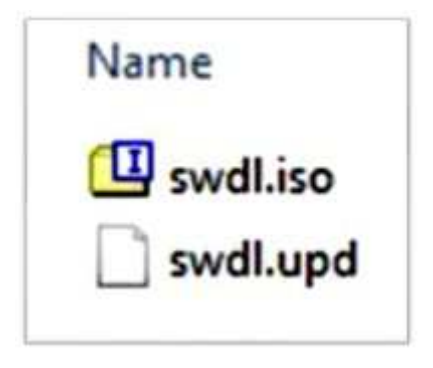
Fig. 1 Two USB Files

NOTE: Two files will be loaded onto the USB flash drive (Fig. 1).