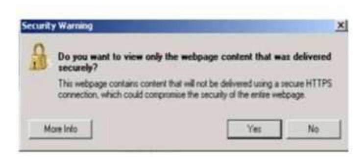
Fig. 2 Pop-up Security Message

NOTE: A blank USB flash drive must be used to download the software. Only one software update can be used on one USB flash drive.