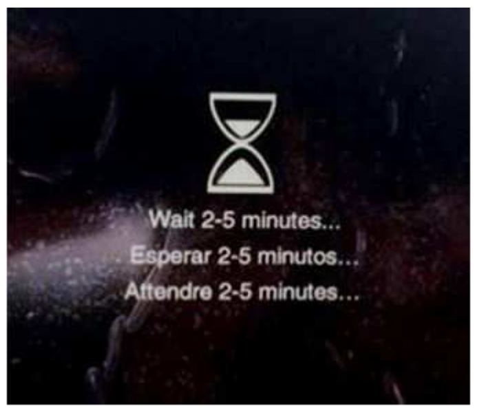
Fig. 3 Hourglass Screen

NOTE: **During the update process you will see multiple hourglass and "Please Insert Update USB" screens for extended periods of time (several minutes)(Fig. 3) or (Fig. 4). DO NOT remove the USB flash drive at this time. Only remove the USB flash drive when the update has completed, when the screen displays the software levels again. The screen will say "Software updated successfully".**