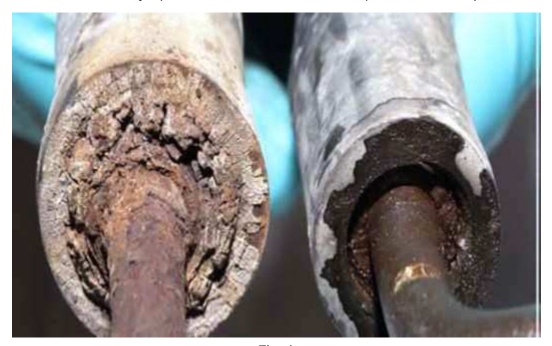
Fig. 1 Example Of Corrosion At Crimps

If the customer describes the symptom/condition listed above, perform the Repair Procedure.