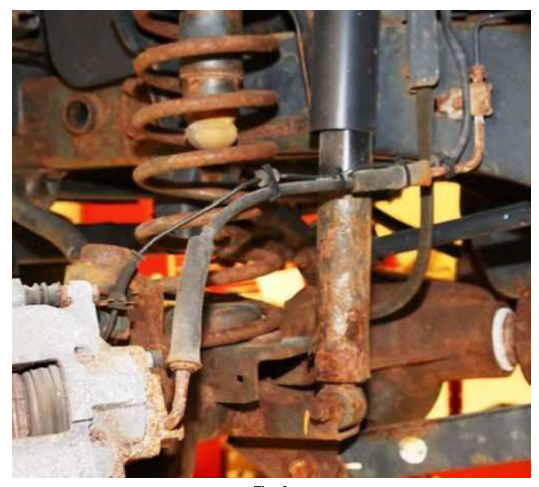
Fig. 2 Original Caliper Brake Hose And Routing