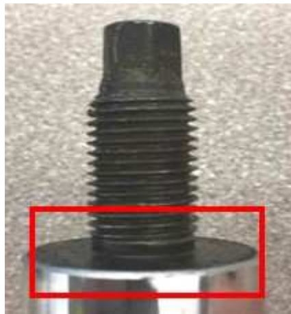
Fig. 5 No Damage To Strut – Do Not Replace Strut