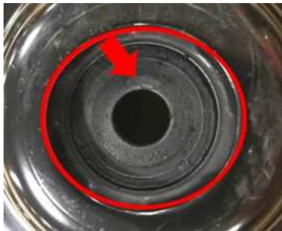
Fig. 3 Rubber Coating On Mount Damaged