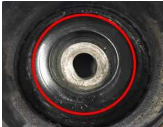
Fig. 2 Top Mount Hole Is Oval Shape Damage