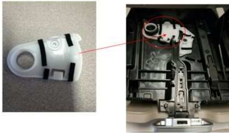
Fig. 4 Striker Plate