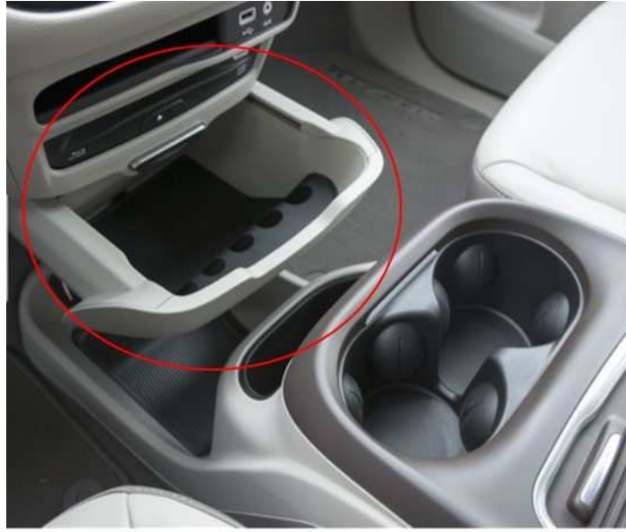
Fig. 1 Center Storage Drawer