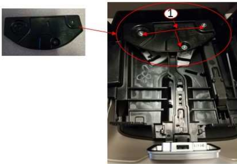
Fig. 2 Cover Plate

2. Remove the screws that retain the latch cover plate (Fig. 2) .