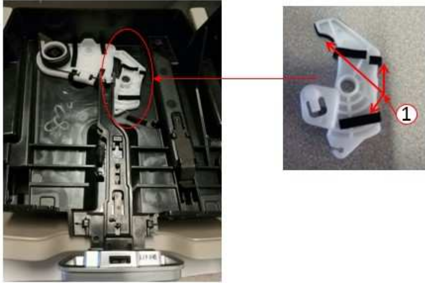
Fig. 6 Latch Pivot