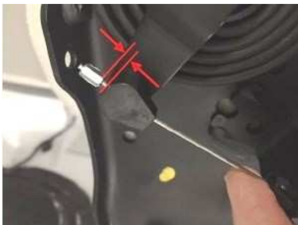
Fig. 4 Cable Slack