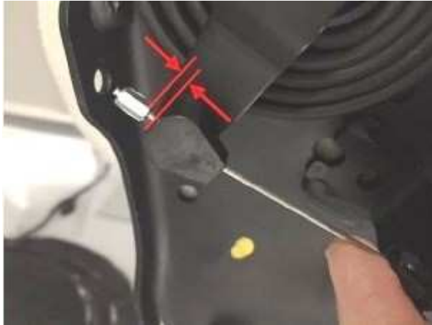
Fig. 1 Cable Slack