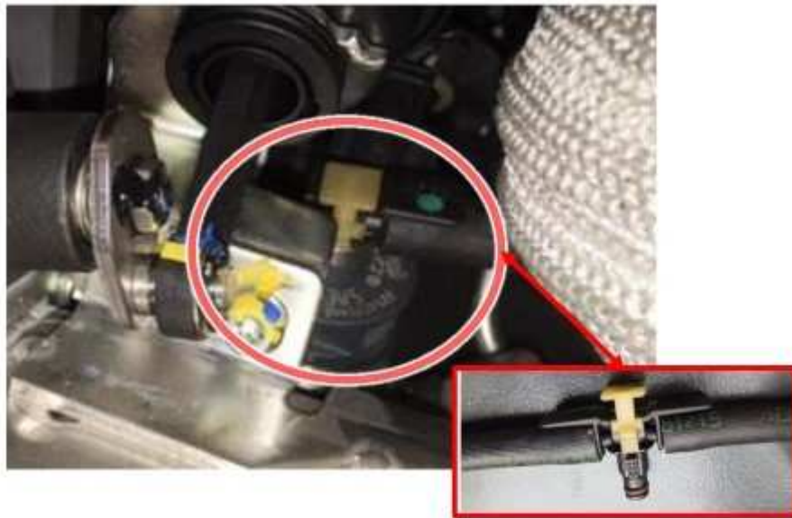
Fig. 1 Injector Return Hose

NOTE: Cylinders are numbered front to back, beginning with the right bank. The right bank cylinders are numbered 1, 2, 3. The left bank cylinders 4, 5, 6. Refer to the detailed service procedures available in DealerCONNECT> TechCONNECT under: Service Info>09 - Engine, 3.0L Turbo Diesel/Engine Block/Description.