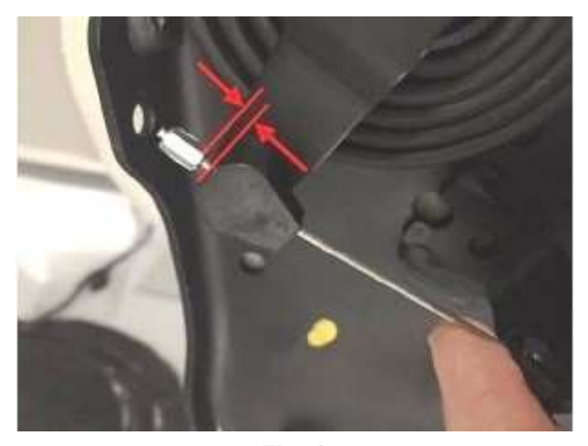
Fig. 1 Cable Slack

4. From under the seat, locate and open the cable adjuster (blue and white plastic fitting) by pulling the tabs on each side to expose the engagement teeth (Fig. 2).