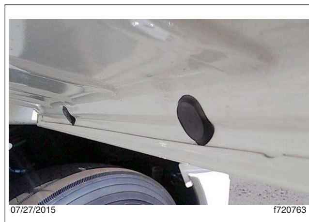
Fig. 2, Plugs Installed in Drain Holes