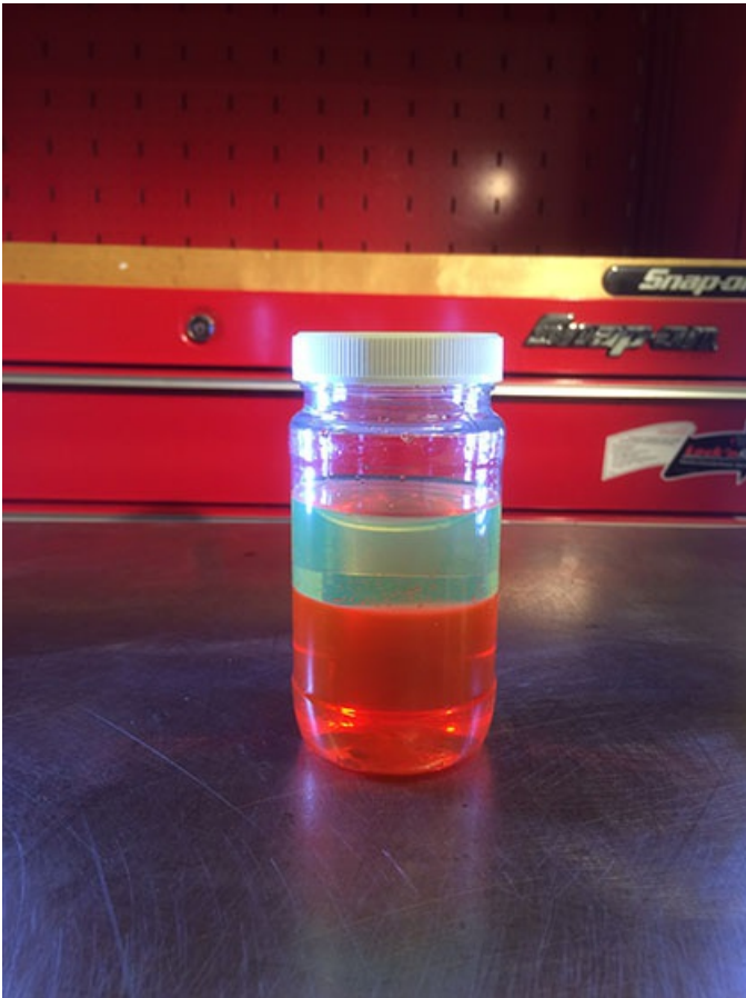
Diesel Fuel and Coolant