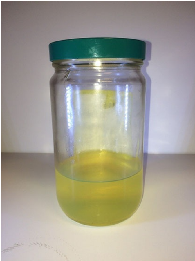
Diesel Fuel and Gasoline