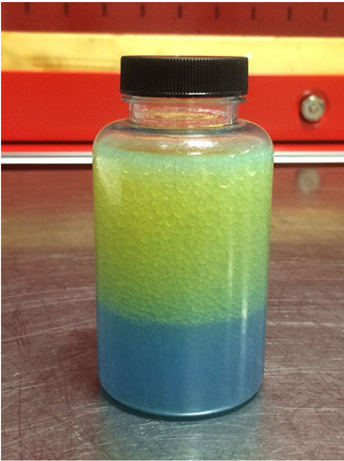
Diesel Fuel and Windshield Washer Fluid