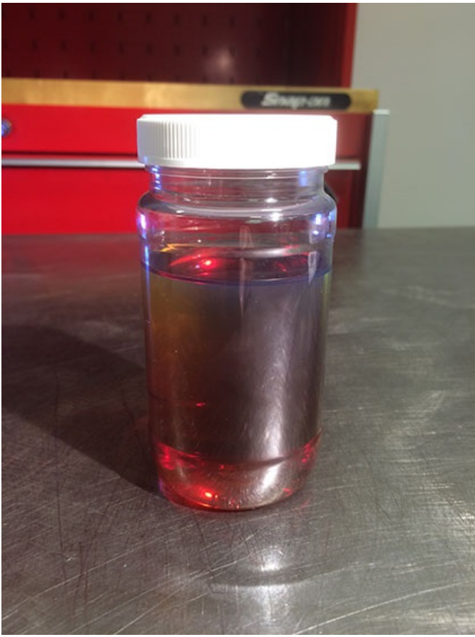
Diesel Fuel and Engine Oil