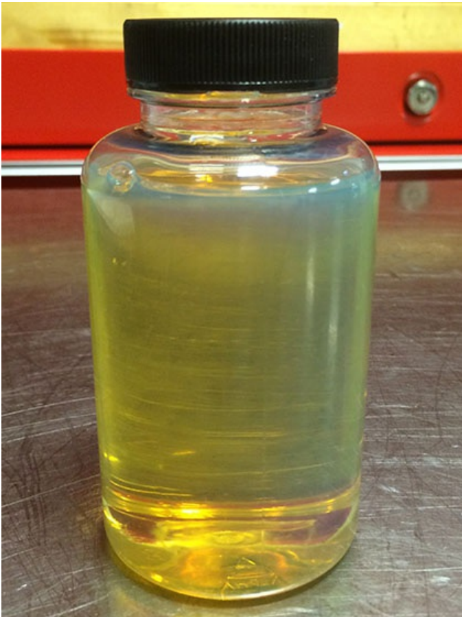
Diesel Fuel and Power Steering Fluid