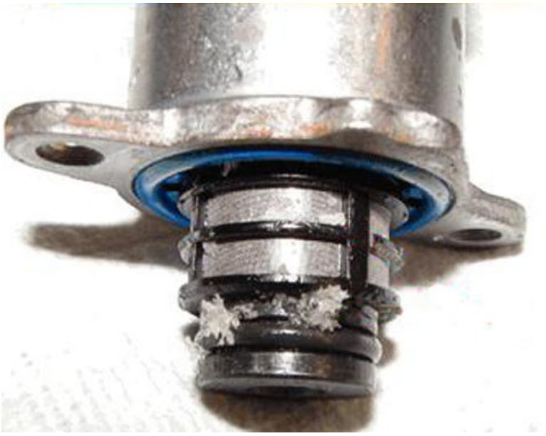
LGH/LML Fuel Pressure Regulator 1 Contaminated With DEF