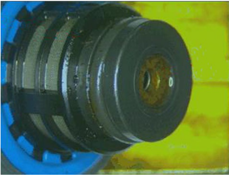
LGH/LML Fuel Pressure Regulator 1 With Rust Due To Water Contamination