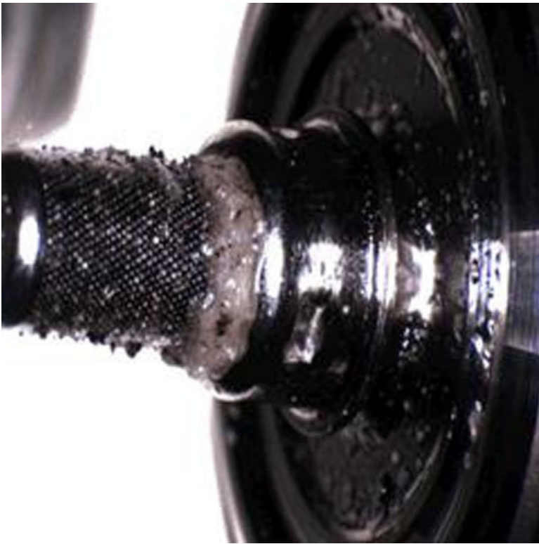
LGH/LML Fuel Pressure Regulator 2 With DEF Contamination