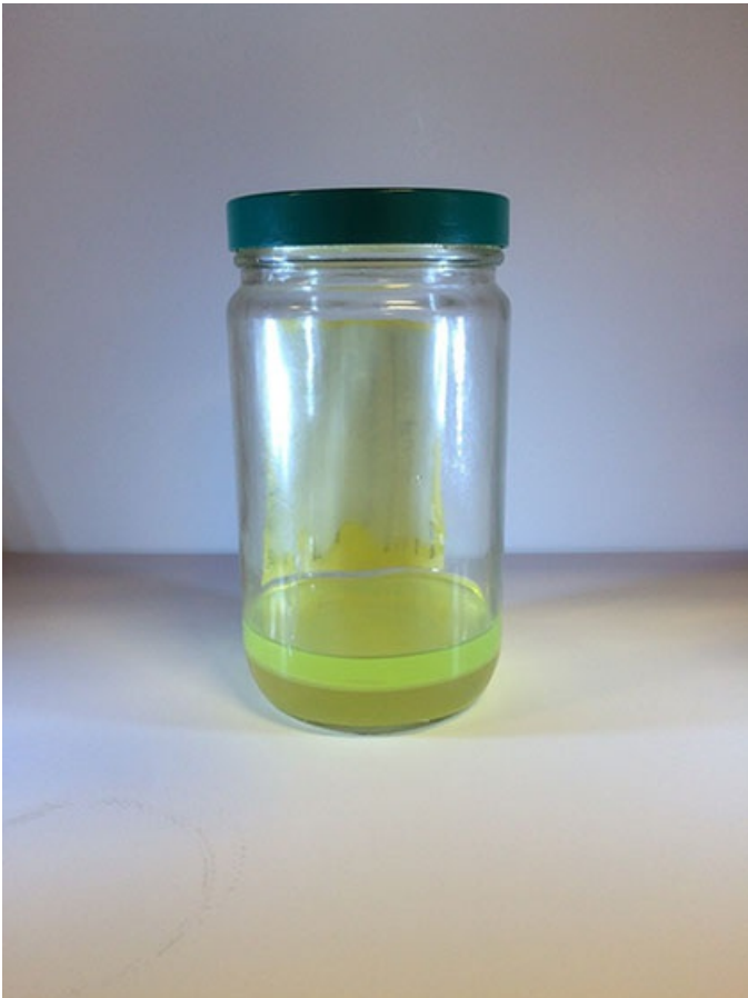
Diesel Fuel and Water