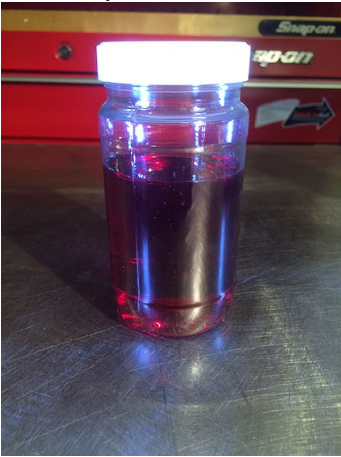
Diesel Fuel and Transmission Fluid