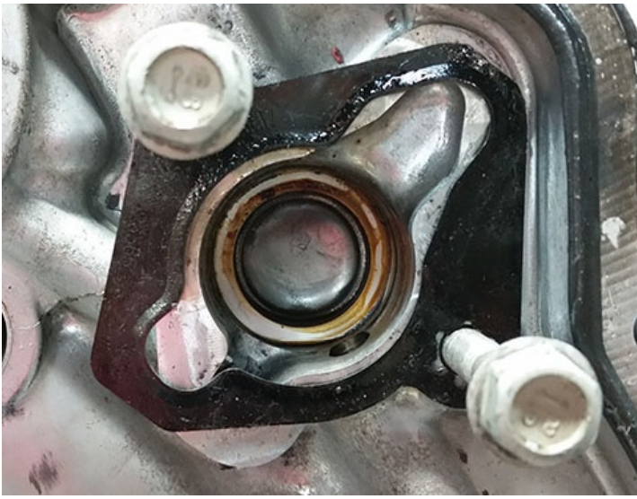
Improperly installed timing chain tensioner gasket allowing pressurized oil from tensioner passage to bleed off behind timing cover.