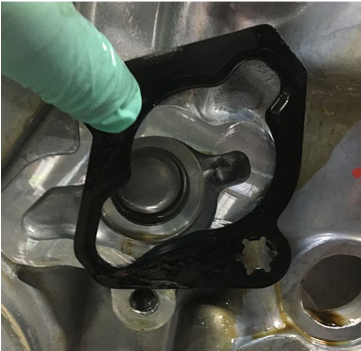
Tensioner gasket shown properly lined up in relation to mounting bolt holes.