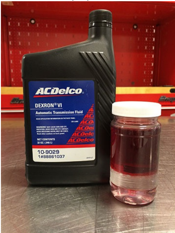
Diesel Exhaust Fluid (DEF) mixed with Transmission Fluid.