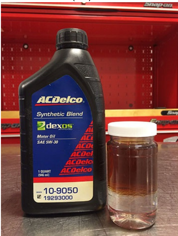
Diesel Exhaust Fluid (DEF) mixed with Engine Oil.