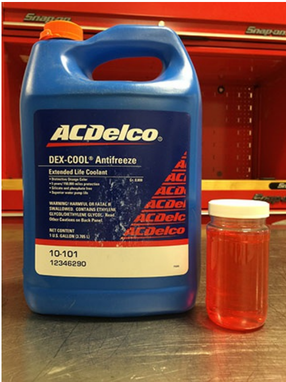
Diesel Exhaust Fluid (DEF) mixed with Dexcool.