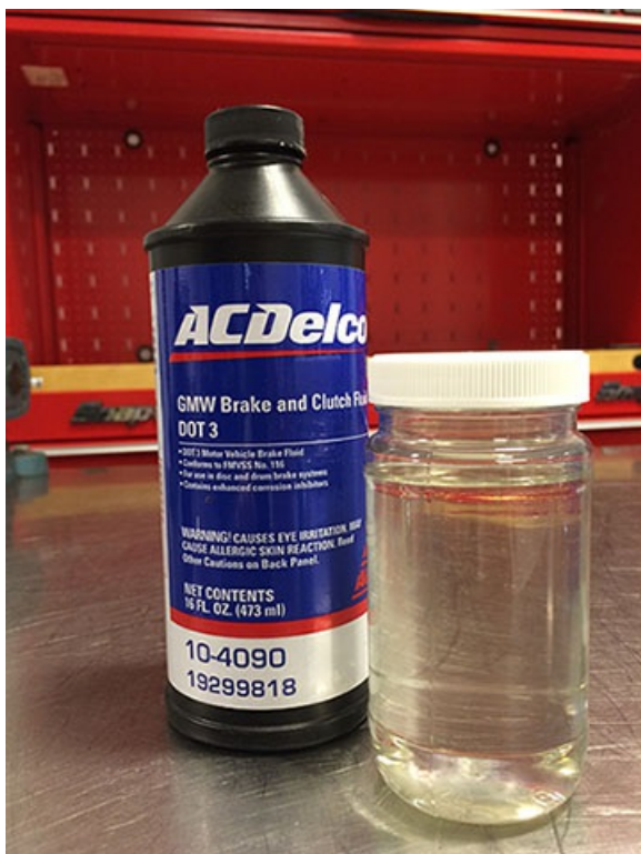
Diesel Exhaust Fluid (DEF) mixed with Brake Fluid.

During inspection of the diesel exhaust fluid (DEF) system and it's components, the dealer may find or suspect contamination. Always refer to Service Information for Contaminants in Diesel Exhaust Fluid Diagnosis and use special tools J26568 Coolant and Battery Fluid Tester or EN50422 Diesel Exhaust Fluid Refractometer for fluid testing. Below are examples of DEF mixed with different sources of contamination.