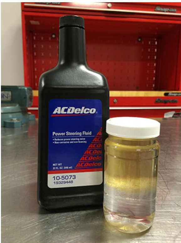
Diesel Exhaust Fluid (DEF) mixed with Power Steering Fluid.