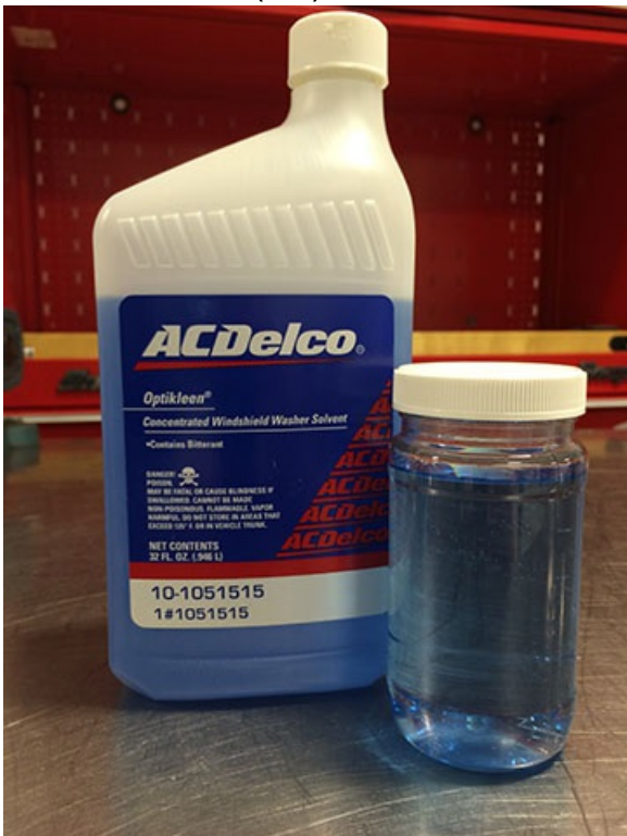
Diesel Exhaust Fluid (DEF) mixed with Windshield Washer Fluid.