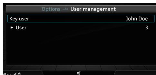
Figure 4. Key User assigned with three secondary users.