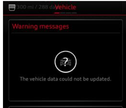
Figure 3. Normal condition warning message.

Tip: Not all errors in the MMI connect app indicate a problem. For example, the message “The vehicle data could not be updated” is displayed when the engine is on or when the vehicle is being driven, as data is not refreshed under these conditions (Figure 3).