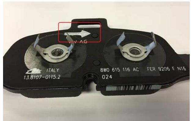
Figure 4. Arrow showing correct installation direction.