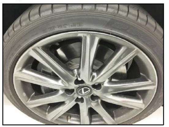
Fig. 3. Aluminum 2 Piece Rotor