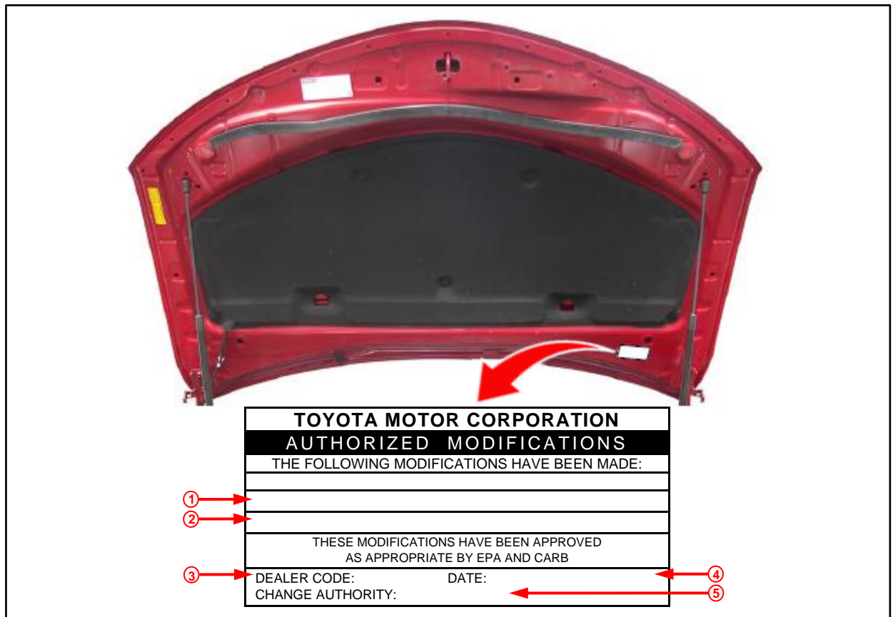
Figure 2. Location of Authorized Modification Label on 2012 – 2014 Camry