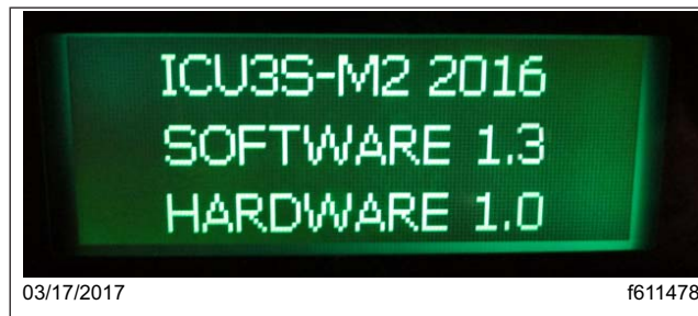
Fig. 1, ICU3S Screen Showing Software Version 1.3 (correct)

If the software level is below 1.3, continue with the next step.