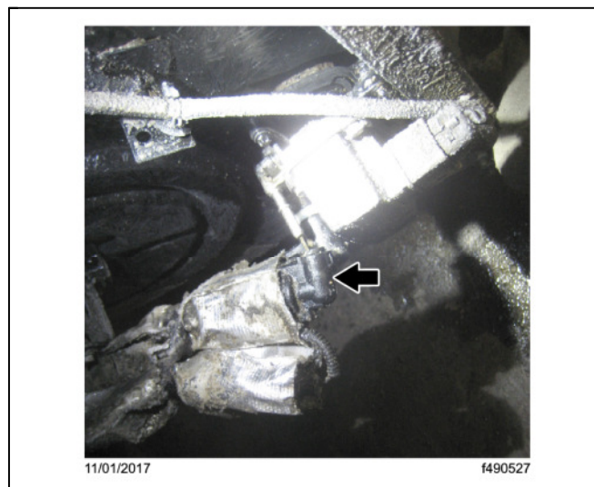
Fig. 1, DEF Line Broken