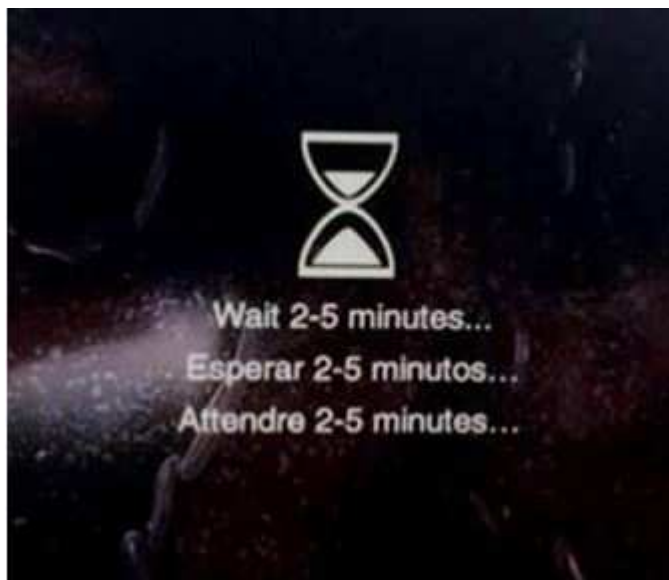
Fig. 3 Hourglass Screen

NOTE: **During the update process you will see multiple hourglass and “Please Insert Update USB” screens for extended periods of time (several minutes)(Fig. 3) or (Fig. 4) . DO NOT remove the USB flash drive at this time. Only remove the USB flash drive when the update has completed, when the screen displays the software levels again. The screen will say “Software updated successfully”.**