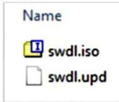
Fig. 1 Two USB Files

NOTE: Two files will be loaded onto the USB flash drive (Fig. 1) .