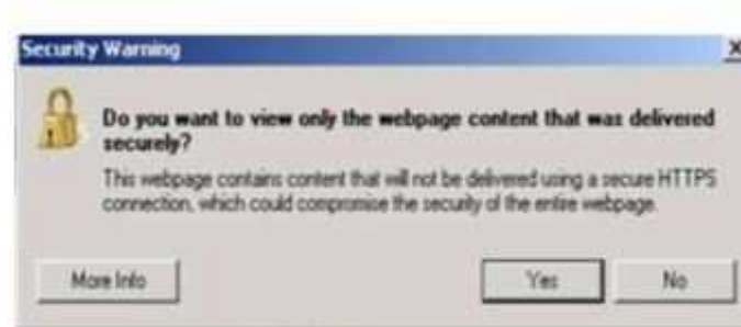
Fig. 2 Pop-up Security Message

NOTE: A blank USB flash drive must be used to download the software. Only one software update can be used on one USB flash drive.