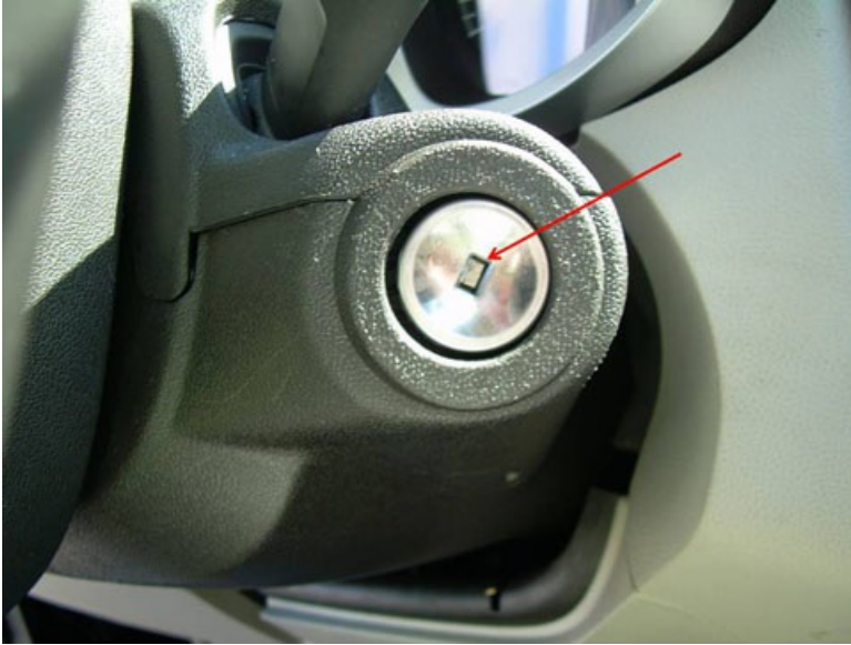
Ignition key door in correct position