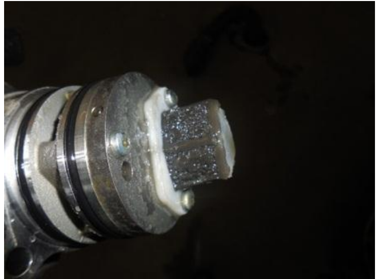
Figure 1. Strainer of pump for four-wheel drive clutch.